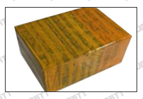
Pic No. 5 International Express Packaging: Wrapped with yellow tape after wrapping black protective film

Mob/Whatsapp: +86 13410541523 Tel: +8675523215133