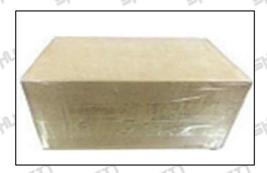
Pic No. 4 Domestic Express Packaging: Wrapped with transparent tape

▲ Minors are prohibited from using transparent tape, yellow tape, black wrapping protective film, and white wrapping protective film to avoid personal injury.