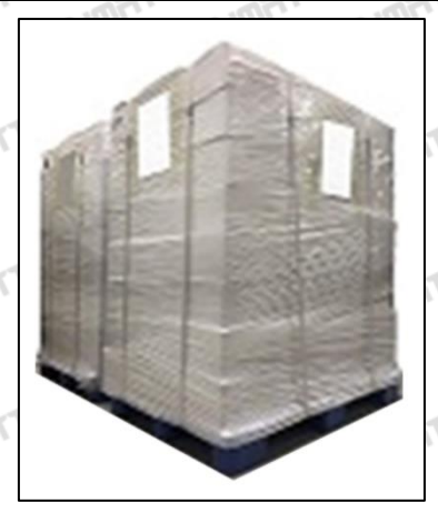
Pic No. 6

Pallet Shipping: Use pallet that meet export requirements, and use white wrapping protective film to wrap and bind with cable ties