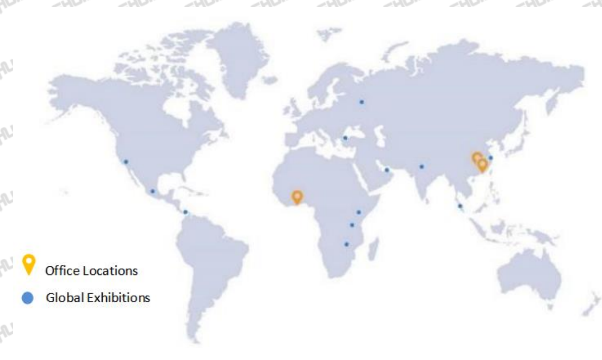
Pic No. 7